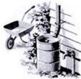
Water Holding Containers

2. Water holding plant mosquitoes ( Wyeomyia sp. ) - develop in a plant called a "tank Bromeliad" where each leaf acts like a tiny cup to trap water.